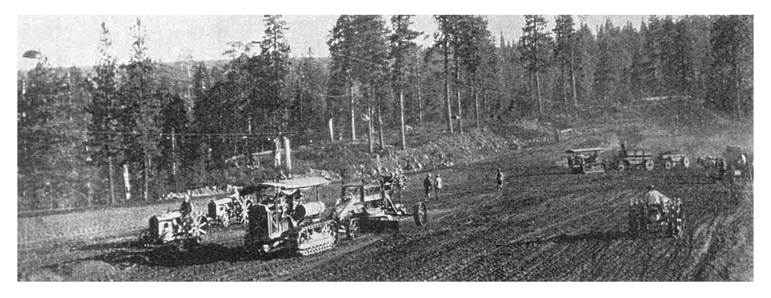
A photo of the construction site showing some of the many pieces of equipment on the job.

8-miles down stream the Hendricks Diversion Dam diverts water into the Hendricks Ditch (canal). This miner's ditch, dating back to 1868 and upgraded by PG&E, directs water down the ridge to the Toadtown Ditch, through the Toadtown Powerhouse to join with the Butte Creek Ditch just above DeSabla Reservoir. The reservoir is the forebay for the DeSabla and Centerville Powerhouses in Butte Canyon.