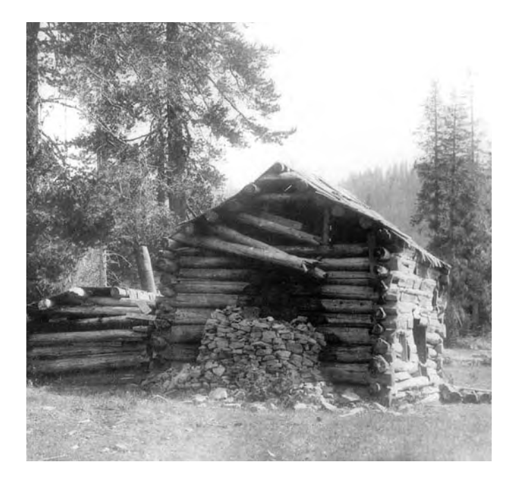
Christopher Lynch built this cabin in the Philbrook Valley about 1877. It was along the creek about a quarter mile above the site of the current dam. This photo was taken about 1906. Alan Knotts.

lies also ran cattle in the valley. The Terrills also had a store with a hotel on the second floor. It was an unofficial post office for the ranchers and miners in the area. The building was on the site of the present dam.