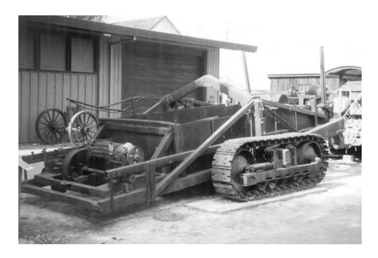
Another view of LeTourneau's telescopic scraper behind a Caterpillar<sup>TM</sup> Sixty tractor at Micki Grove Park. The five buckets are in the fully loaded position. The electric motor and gear mechanism that moves the buckets is visible behind the fifth bucket. Author.

ward, the front of the fifth bucket engages the rear of the fourth as it is filled and moves to the rear with the fifth. In sequence the other three buckets filled in like manner until all are loaded. When fully loaded, the scraper appears to have one bucket that is 15-feet long. To unload, the buckets work in reverse with the fifth bucket moving forward to push the dirt in the fourth bucket that pushes the dirt in the third and so on until the load is dumped. The raising and lowering of the scraper blade and the telescoping of the buckets were powered by electric motors run off of a generator on the towing tractor. The unit was mounted on tracks making it possible to traverse almost any kind of ground surface. It was pulled by a 60-horsepower, Caterpillar<sup>™</sup> tractor and 10-yards of dirt could be loaded in less than a minute. With the loaded bucket(s) lifted off the ground, the tractor could travel at its highest speed. The result was revolutionary, a high-capacity, relatively fast moving scraper, operated by one man, that left a smooth surface behind it. It was the first modern earthmover.<sup>16</sup> Four of these "telescopic scrapers" made it possible to move some 169,000 cubic feet of material and complete the Philbrook Dam in less than five months.