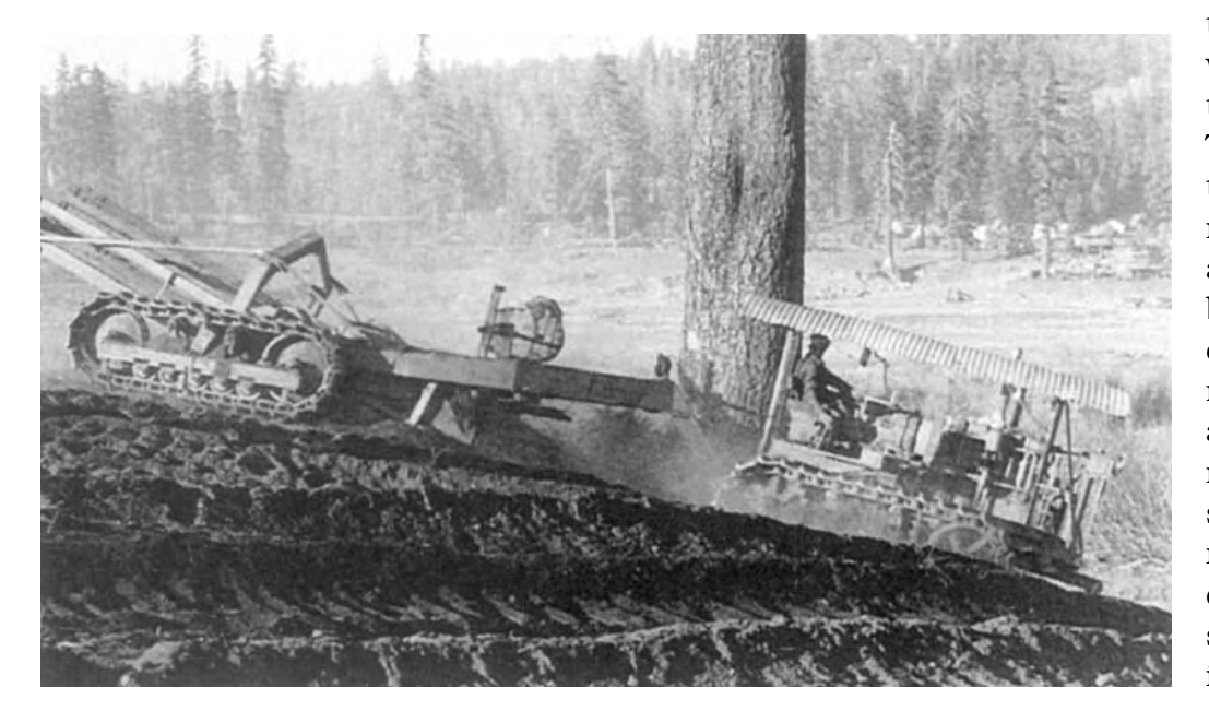
Two views of the telescopic scraper at Philbrook Dam. The one in the top photo appears to be dumping its load of dirt while the one in the bottom photo is scraping up a load as is evident from the smooth trench behind it.

All this equipment moved over the Southern Pacific's Butte County Railroad from Chico to Stirling City. It then was hauled and driven the remaining 15 miles up to the Philbrook Valley. The Oroville Daily Record states: "A road is now being constructed by the Pacific Gas and Electric Company to the scene of the dam site."<sup>22</sup> Apparently PG&E actually was improving the old cattle and later wagon trail used by the cattlemen and miners. A wood bridge crossed the