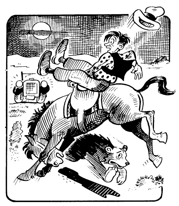
It was at Philbrook the boys used to chase wild animals with their car lights. One night they got a bear in their lights, chased him round and round, finally between the legs of the night grade foreman's horse. Grade foreman landed on grade.

On September 23, midway through the construction job, the Coon Hollow Fire started near