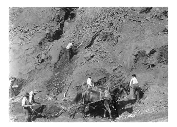
A two-horse drawn Fresno Scraper at work building the Magalia Dam sometime after 1916. The man in the foreground is driving the team while the man next to him uses a loop-shaped lever to tilt the scraper blade into the ground. This was state-of – the-art in those days. Paradise Irrigation District.

The simple dirt moving devise known as the Fresno Scraper was invented about 1880. It is said that the Fresno has moved more dirt than gossip ever did and it is considered to be second only to the wheelbarrow in earth moving history. Dragged by one to four horses or mules, the Fresno is a flat bucket, three to five feet wide, with a cutting blade on its forward edge. It is dragged on its bottom and manually operated by a lever. The operator tilted the blade down into the earth to fill the bucket. When full, he tilted it upward to a horizontal position and the bucket was dragged with its load of dirt to the dumpsite. Then men with shovels had to smooth out the dirt.